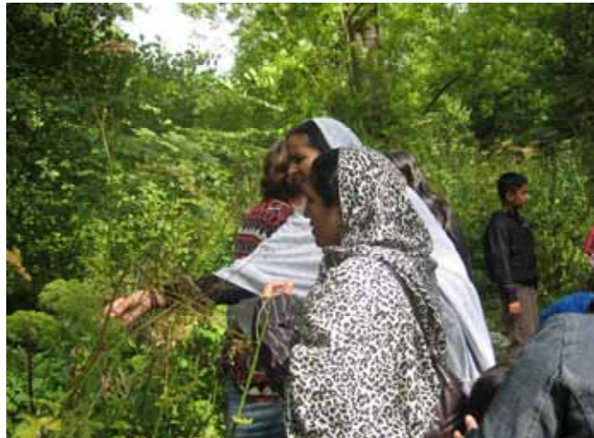
Sheffield Black & Ethnic Minority Environmental Network (SHEBEEN)

"With Ethnic Minorities who have left behind a rural background when they migrated to the United Kingdom there is an intense sense of re-union with nature of coming home when they have access to the environment. Nature to them is always the same, the familiarity with grass is always recognised as grass, a tree is always a tree, beyond that there is no landscape that is completely unique, some BME groups are extremely touched by the similarity of micro-landscapes that remind them about aspects of their country of origin".